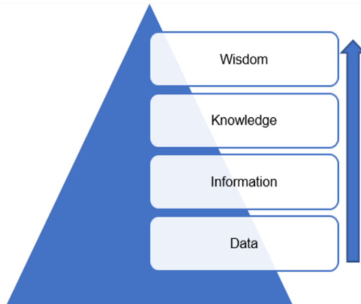
Figure 1. DIKW Pyramid

below, has been used for several years to show this difference (Fernanda & Salwa, 2018).